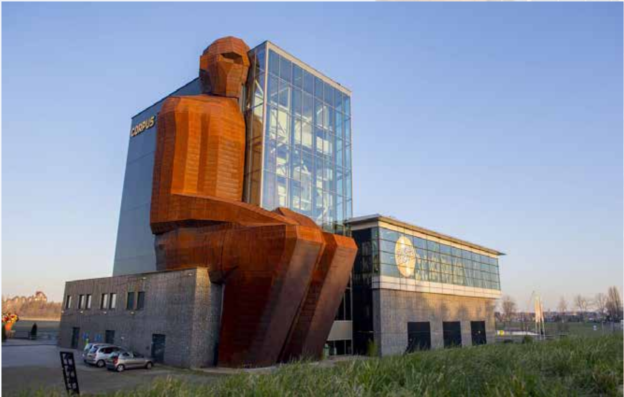
CORPUS Congress Center, Bio Science Park Leiden, the Netherlands